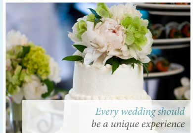
Every wedding should be a unique experience