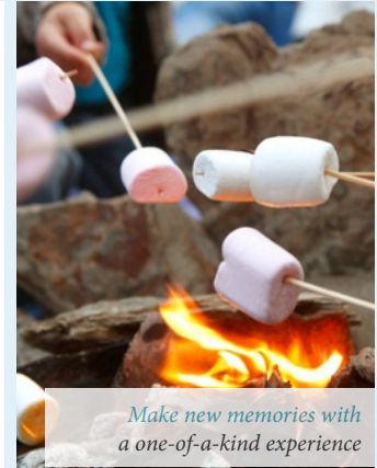
Make new memories with a one-of-a-kind experience