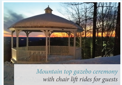
Mountain top gazebo ceremony with chair lift rides for guests