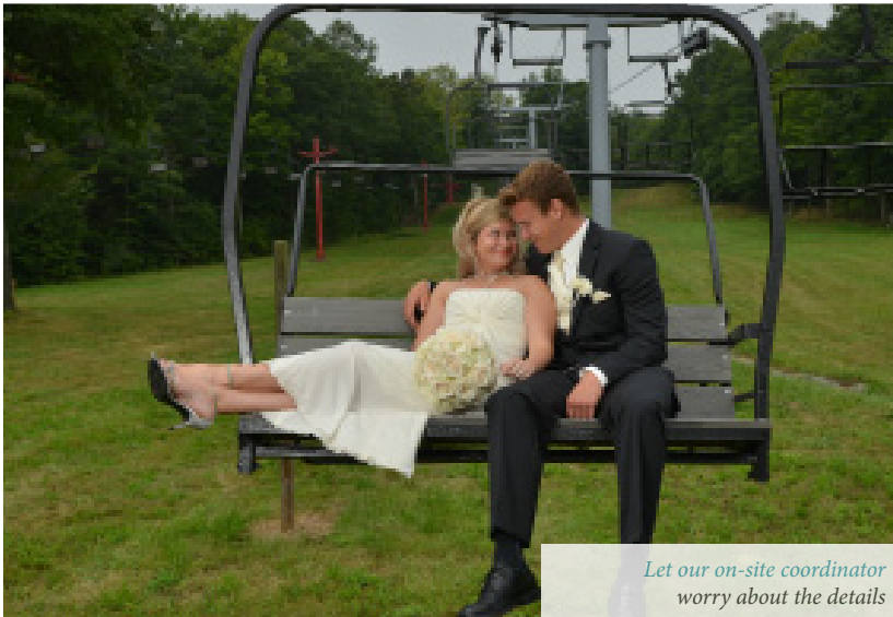
Let our on-site coordinator worry about the details

Mountainside Views, Unforgettable Moments