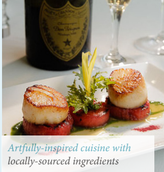
Artfully-inspired cuisine with locally-sourced ingredients