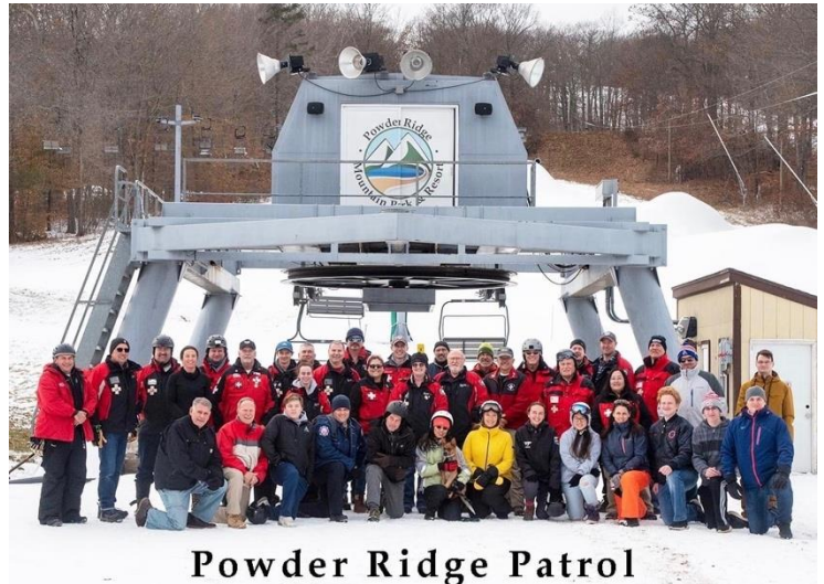
Powder Ridge Patrol